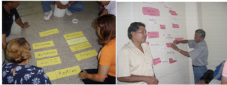
Fig. 7. Pictures showing teachers during workshops learning to use concept maps without a computer, as would take place in the classroom.

having them train the teachers -- cascade training gets watered-down pretty fast. Thus, it was decided that to the extent possible, all classroom teachers would be trained not only on the use of technology but in new methodologies needed to implement a meaningful learning environment in the classroom.