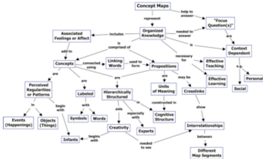
Fig. 1. A concept map that shows the key features of concept maps, as we define them.

maps represent Organized Knowledge,’ and ‘Concepts are Perceived Regularities or Patterns.’ In some cases, the proposition includes more than two concepts; for example, ‘Concepts are Labeled with Symbols.’ There is no restricted list of linking phrases – the map builder is free to use whatever phrase he/she prefers, as long as the concept-linking phrase-concept triad forms a sensible proposition. It is recommended that concepts and linking phrases be kept to as few words as possible. This propositional nature of the concept map, together with the freedom to select linking phrases, distinguishes concept maps from other types of graphical representations such as mind maps, argumentation maps, decision maps, and process maps.