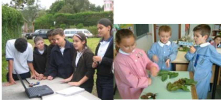
Fig. 6. On the left, high school students from the Instituto de Educación Integral, in Costa Rica, are observing meteorological data on their laptop that they will compare with data from other countries using the WWW. Their work, including the data collected, is integrated through concept maps. The picture on the right shows Italian elementary school students conducting studies with plants to learn how plants grow and reproduce. Their school is part of a larger pilot effort that includes 150 teachers in Northeastern Italy.