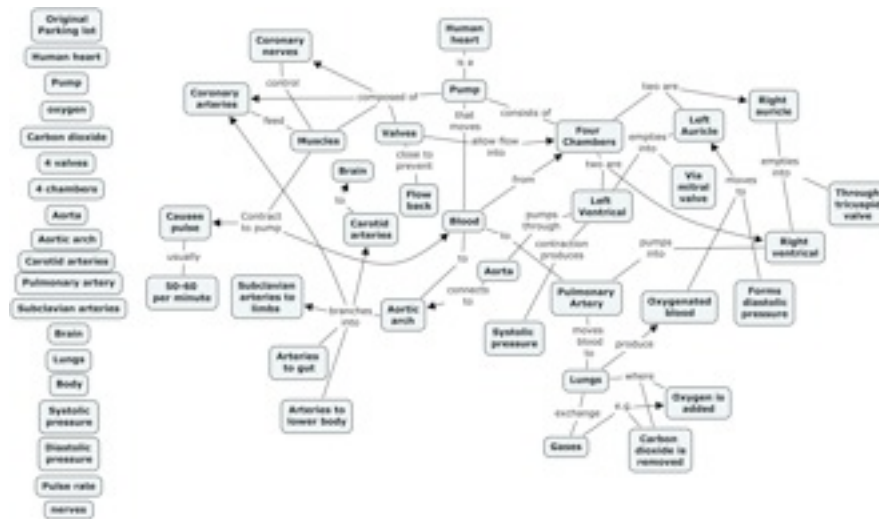
Fig. 2. Illustration of the end product in the construction of a concept map beginning with ordered concepts in a “parking lot.” The map addresses the focus question: How does the normal heart function?