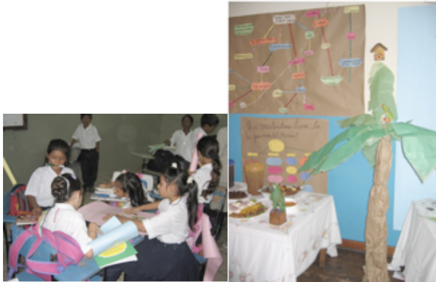
Fig. 8. The picture above shows students collaborating on the construction of concept maps in the classroom. On the right is a partial display of the material developed by students as part of a project.

schools. The goal is for the technology to fully support and facilitate the sharing and collaborating environment needed to implement the concept map-centered learning environment described in this chapter.